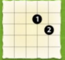
D5 (no Third) X X 0