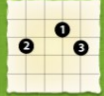
Dsus2/C X 0 0