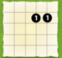
D Major 7 sus2 X 0 0 0