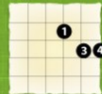
D sus4 X X 0