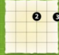
D6 Fingering 1 X X 0 0