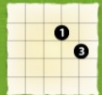
D sus2 X X 0 0