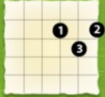
D Triad Fingering 1 X X 0