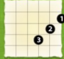
D6 Fingering 2 X X 0