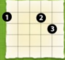
D/F# (First Inversion) 0 0 X