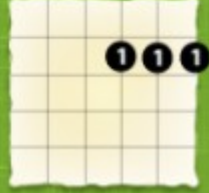
D Major 7 X X 0 0