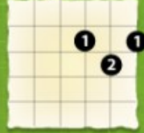
D Triad Fingering 2 X X 0