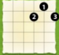
D7 X X 0