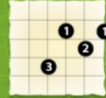
D/F# (First Inversion) Fingering 2 X X